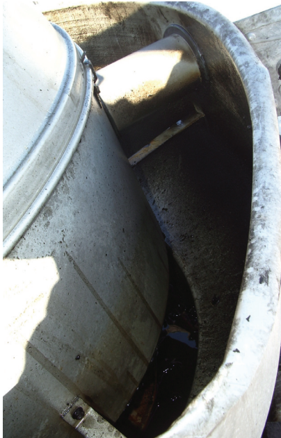
Typical extractor, 3 months since prior cleaning. Notice the accumulation of grease liquids in the bottom of the extractor.