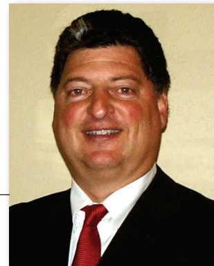
By Joe Salpietra

Investigation of a second-generation disposable grease removal device for exhaust hoods.