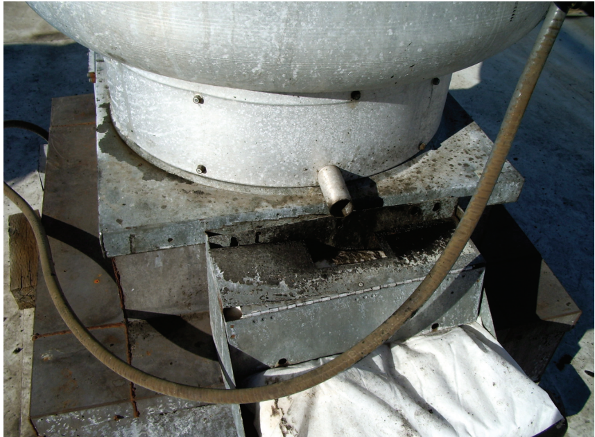
Another typical extractor with overflow discharge, 3 months since prior cleaning. Notice the overflow has spilled onto the roof area around the extractor.

many of these systems is a significant increase in the cost drivers, such as labor, water consumption, chemical usage, etc., which has made these alternatives not very widely used in the marketplace.