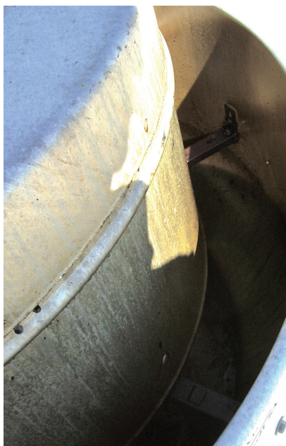
Applebee's Murrieta, California, extractor with the new system, 6 months since prior cleaning.

Notice the bottom of the extractor has only a light film of grease effluent, and there is no accumulation of liquid grease in the bottom of the extractor.