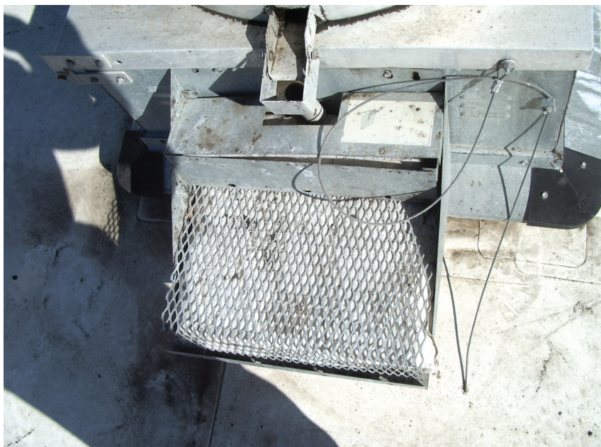
Applebee's Murrieta extractor with the new system, 6 months since prior cleaning. Notice there is no overflow 6 months after prior cleaning — the roof area around the extractor remains grease free.

While the benefits of using DGRDs include many things that have a direct cost savings or safety impact, they are also very earth-friendly. DGRDs are generally all-natural, sustainable products that are 100%